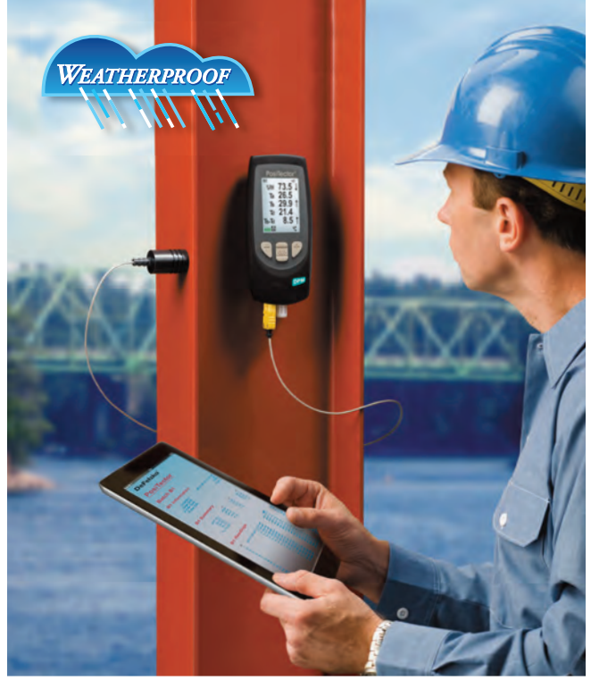
Analyze uploaded readings using a web browser from anywhere – jobsite or head office.